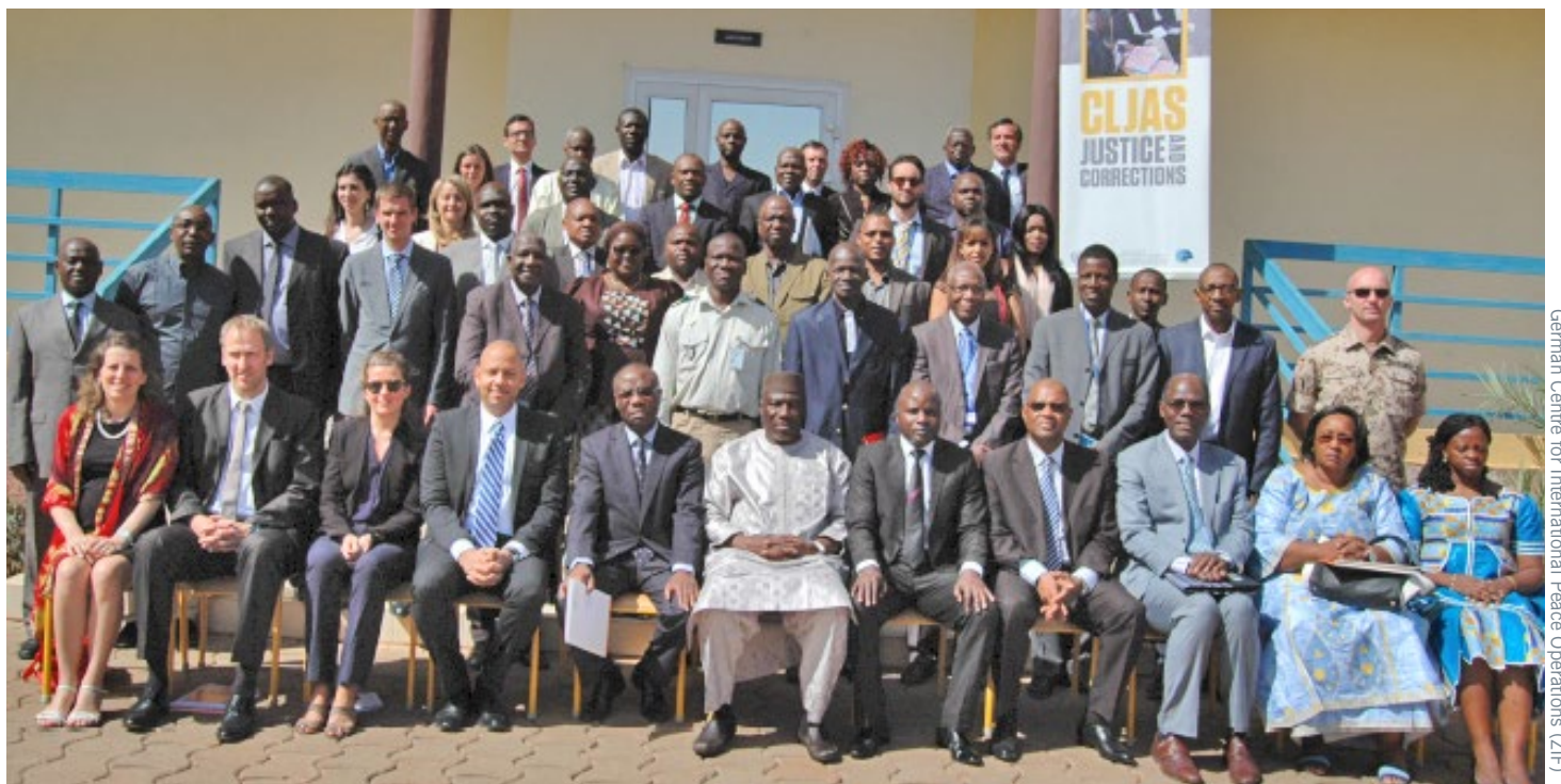
Participants in the DPKO Rule of Law Training Programme for Judicial Affairs Officers in Mali, March 2015.