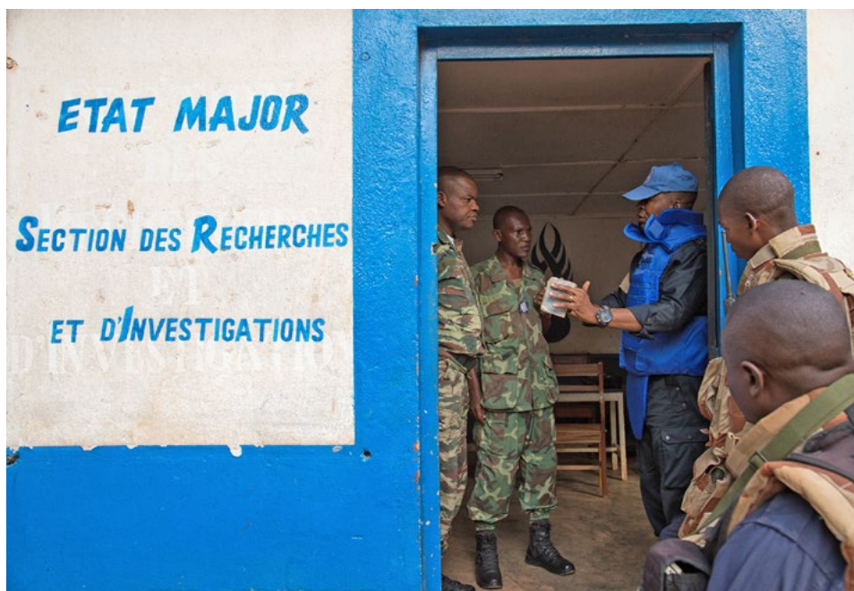
UNPOL Operation in Boyrab.