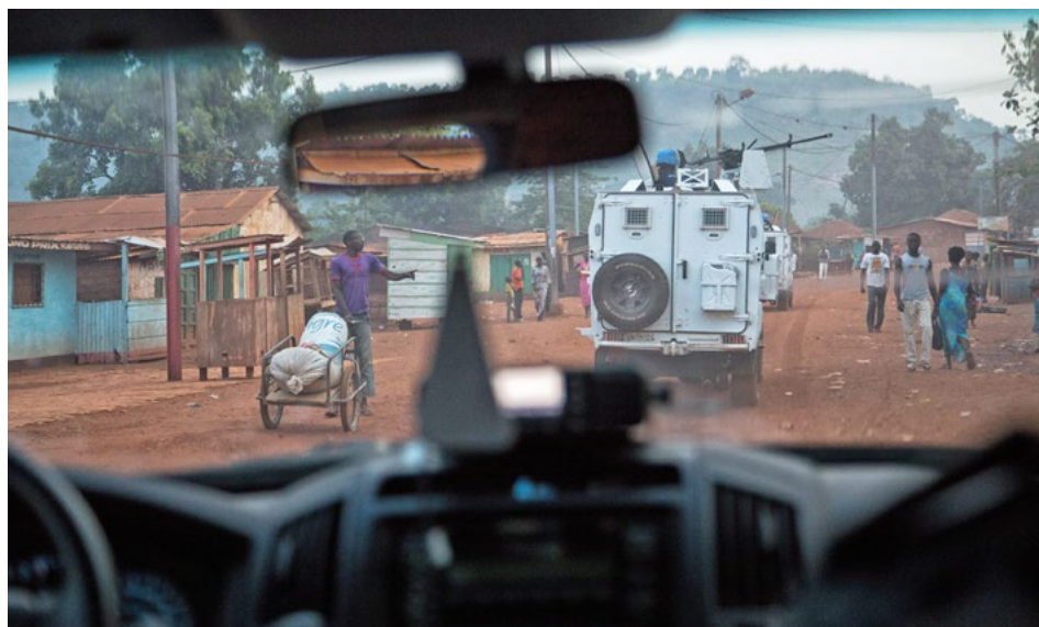
United Nations vehicles moving through the streets of the Central African Republic.

We promote the rule of law by addressing issues related to both justice and prison systems in conflict and post-conflict environments through United Nations peacekeeping and special political missions. This Update highlights the important work of justice and corrections components working in peace operations around the world.